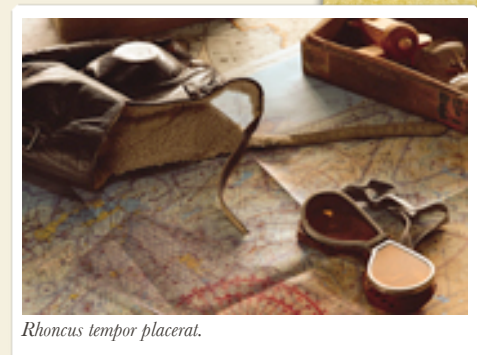
Rhonus tempor placerat.

Please check out this website and email a thank you and/or comments to the PCGS email address: < polkgen@gmail.com >