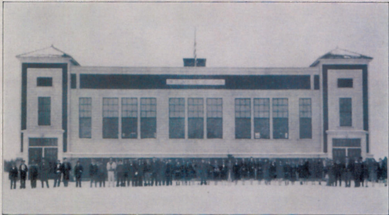
High School and Student Body of 1931