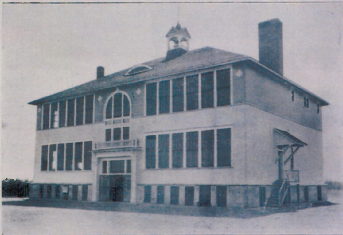
State Graded School